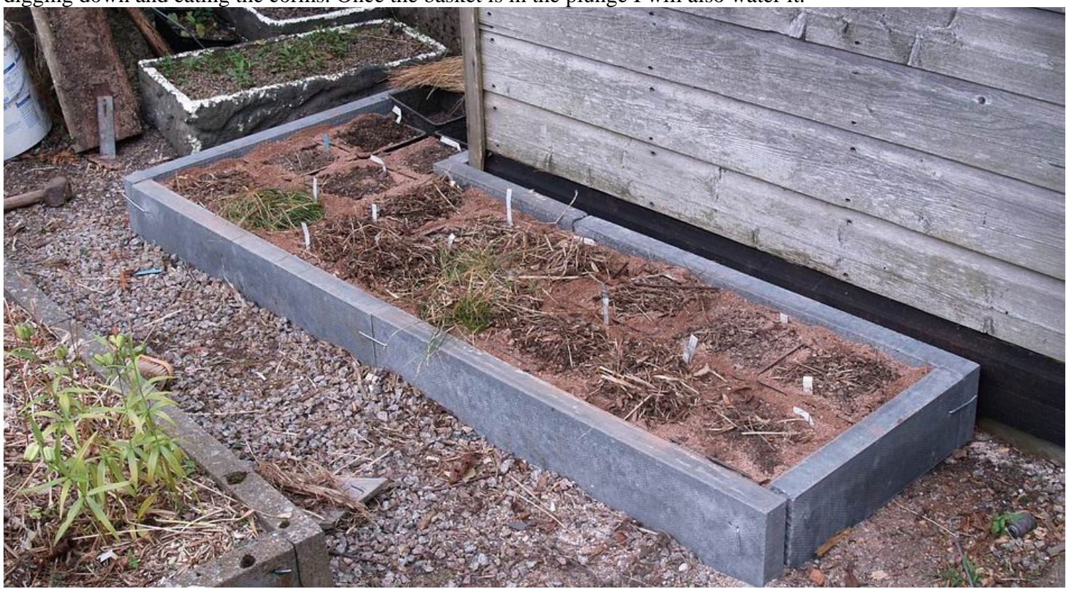
Now all the baskets have been replanted I can place them in the frame and fill the gaps with nice sharp sand and that is the frame ready for a top dressing. This frame is for bulbs that enjoy cooler moist conditions so I will top dress it with shredded prunings which I find not only keep weeds down but also helps retain a lot more moisture.

I can now fill the basket up with more compost gently shaking and tapping as I go to ensure the compost goes all the way down trough the corms. Next I place a piece of weld mesh over the top of the basket to prevent mice from digging down and eating the corms. Once the basket is in the plunge I will also water it.