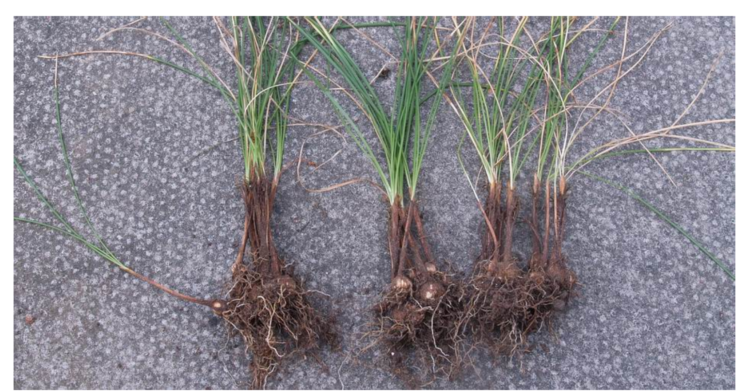
Crocus pelistericus corms

It is very difficult to know just when to repot Crocus pelistericus because it never goes dormant. In our cool moist conditions the leaves stay green until Autumn and they will only go back early if I dry the plant out completely.