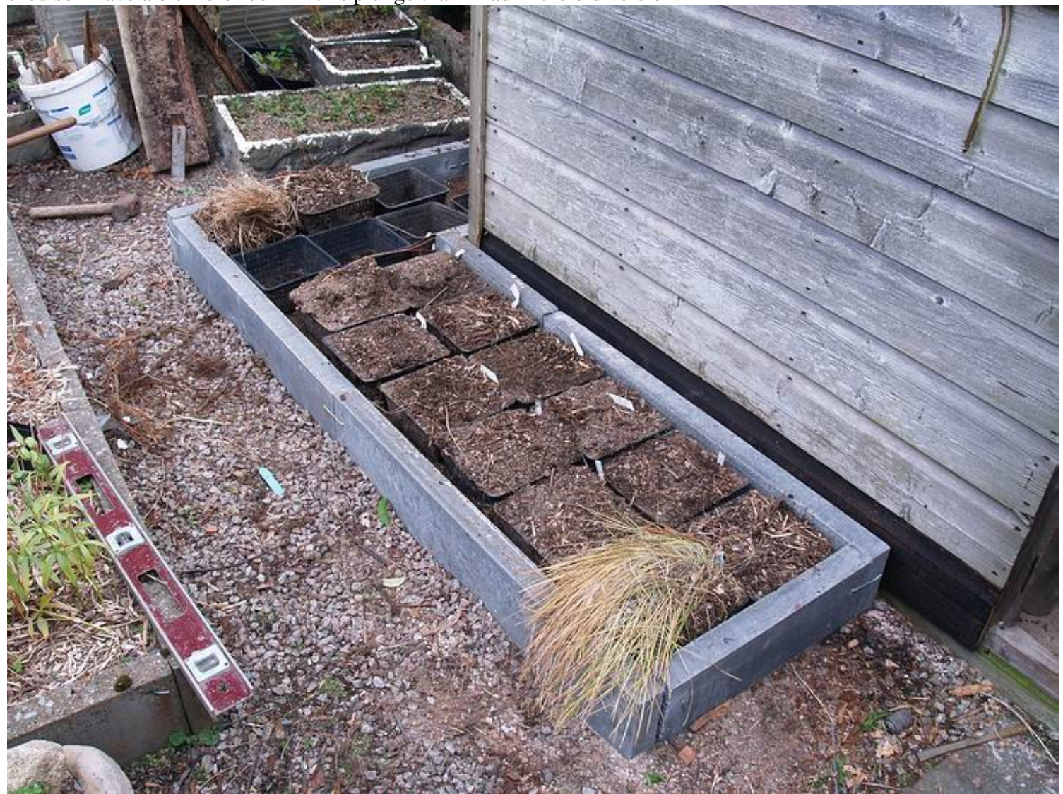
I find that cutting one of the slabs in half gives me a perfect width to accommodate two of the plunge baskets that I use for bulbs - I can fit twenty two neatly into this rebuilt bed and still leave space for sand all around the baskets.

I have made this bed slightly narrower than the old wooden one but then I have wrapped it around the corner of the shed so I have a bit more room in this plunge than I had in the old version.