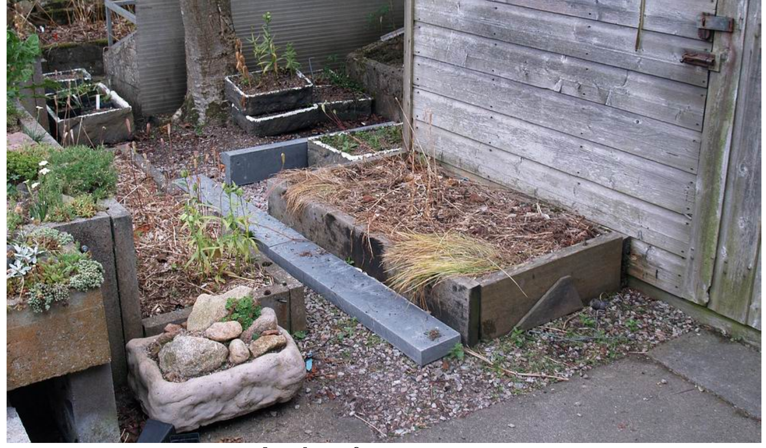
Many years ago I built this wooden plunge frame which is now starting to rot and needs replacing.

In the back garden the troughs full of Rhodohypoxis are just coming to their peak of flowering and how they are enjoying the sunshine we are getting just now. Provided they have plenty of water they can cope with any amount of heat that our Scottish climate can provide and after a night of rain I spent hours taking pictures of all the rain drops suspended like jewels on the flowers. I still water the troughs even though we get rain because they are so densely planted that much of the rain water is shed away from the trough as the flowers act like an umbrella. I also apply a liquid feed with low nitrogen and high potassium, such as tomato feeds, to help build up the small corms and keep the plants healthy. The next time I get a seed set on my Rhodohypoxis I intend to scatter it onto the drives at the front to see if they will grow there.