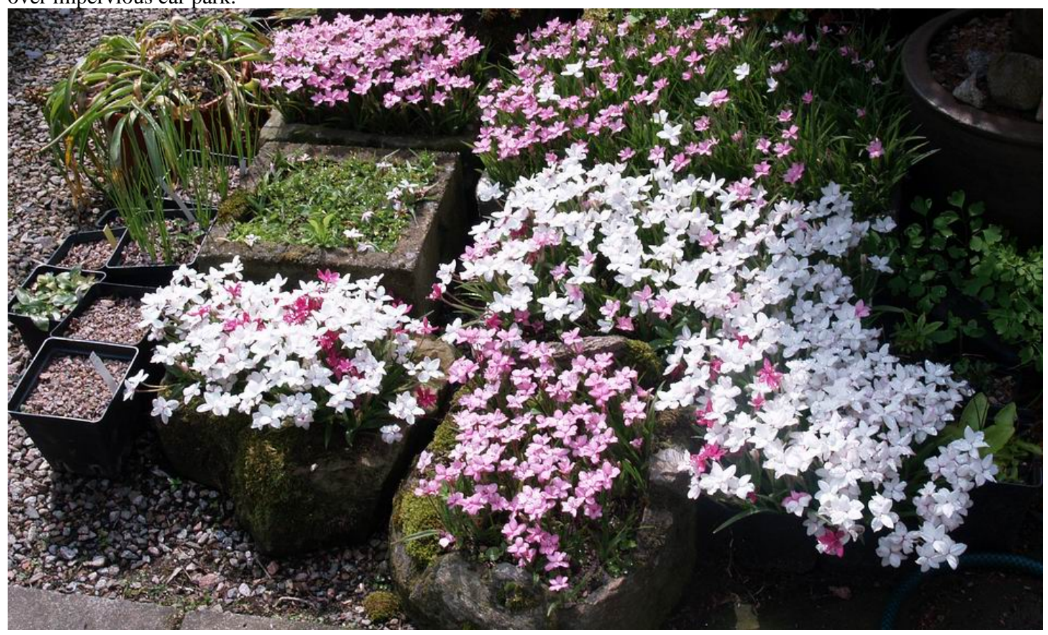
Rhodohypoxis in troughs

Our east drive has less variety planted as this is the drive where our wee car stays so plants have to be low enough not to have there heads pulled off. Also I only started seeding plants into this drive several years after I found the west drive such a success. I cannot tell you how often we get workmen calling at our door offering to tidy up our "weedy drive-way" and lay lock blocks or tarmac in its place – you can guess the response they get from me. How I wish that there were regulations forbidding people from turning their front gardens into a completely paved over impervious car park.