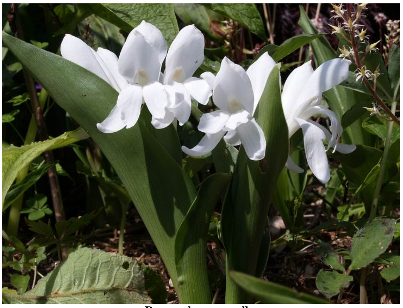
Roscoea humeana alba